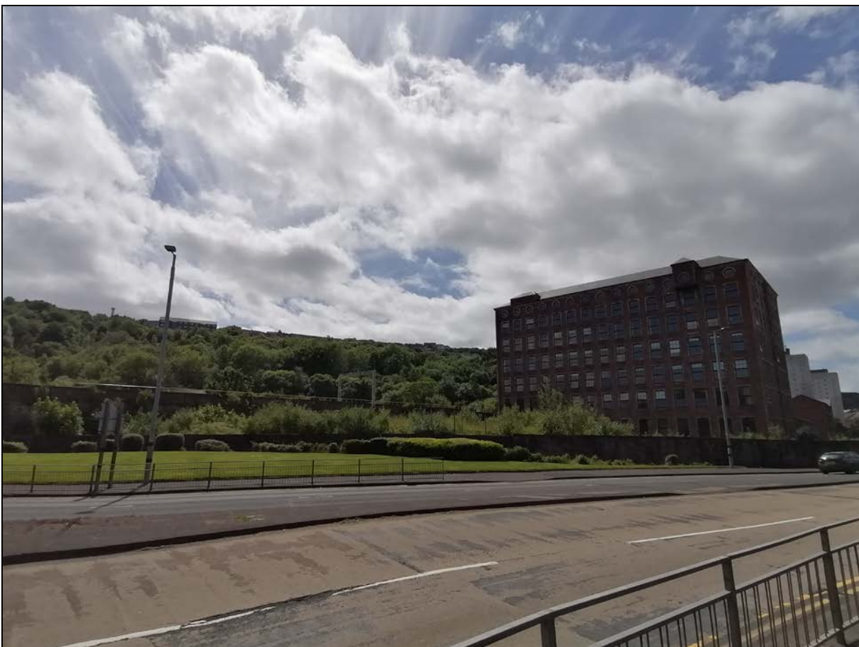
View of the site and Ropeworks Building from the north side of the A8.

In addition, as the application includes the provision of new buildings, Policy 6 in both LDPs is applicable. Policy 9 of the adopted LDP and Policy 10 of the proposed LDP are relevant as the proposal is for a housing development with multiple units that does not drain directly to coastal waters. As the proposal relates to the construction of new housing which will result in an increase in traffic and vehicular parking in the area, Policies 10 and 11 of the adopted LDP and Policies 11 and 12 of the proposed LDP apply. As the site is brownfield in nature and contained previous development Policy 16 of the adopted LDP and Policy 17 of the proposed LDP apply. Policy 29 in both LDPs requires consideration as the proposal is adjacent to the Category 'A' listed Gourock Ropeworks building.