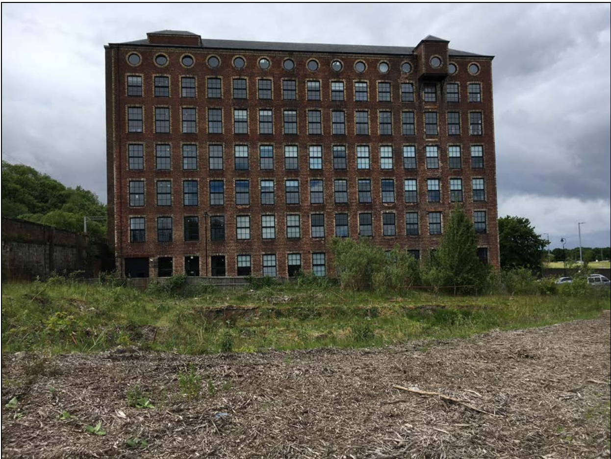
View of the 'A' listed Ropeworks building from within the site looking west across the site.

The proposal identifies a main open space area to the rear and east side of the building, which covers approximately 720 square metres, providing an appropriate level of private amenity space for residents. The site will also contain smaller areas of open space along the west side of the building and north-east side of the car parking area. I note that no landscaping scheme has been provided for the open areas within the site. This matter can be secured by condition to ensure that a suitable landscaping scheme is provided and maintained in order to provide a high level of visual amenity.