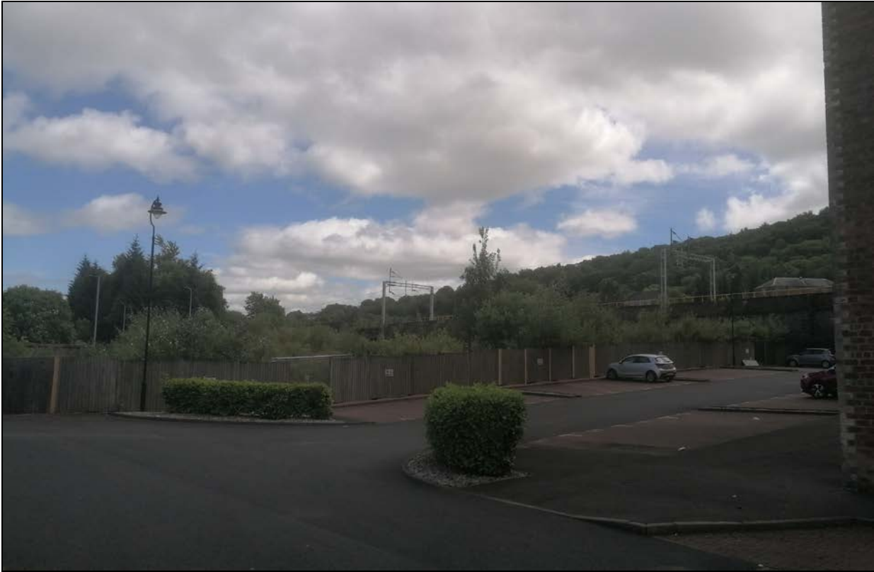
View of the site facing south-east from across the Ropeworks car park.

In considering the provision of daylight to the residential properties proposed, the applicant has submitted a daylight assessment report which confirms that the adjoining railway viaduct to the south does not result in unacceptable levels of daylight to the proposed south facing ground floor windows. I note the concerns raised in the representations relating to overlooking and an invasion of privacy from the west facing windows. In considering this, I note the Council's window to window intervisibility guidance, which requires a minimum 18 metre distance be provided between windows that directly face one another. The closest windows on the west elevation of the building accord with this requirement, being set back at least 22.9 metres from the adjoining Ropeworks. Whilst acknowledging that all windows meet the window to window intervisibility guidance, following further discussions with the applicant they have agreed to provide smaller window openings on the west elevation, which can be considered both a betterment in terms of privacy and it avoids creating a large blank wall facing onto the neighbouring residences. Based on the above assessment, I consider the proposal to be in accordance with the guidance in both PAAN 3s and will not result in an unacceptable invasion of privacy.